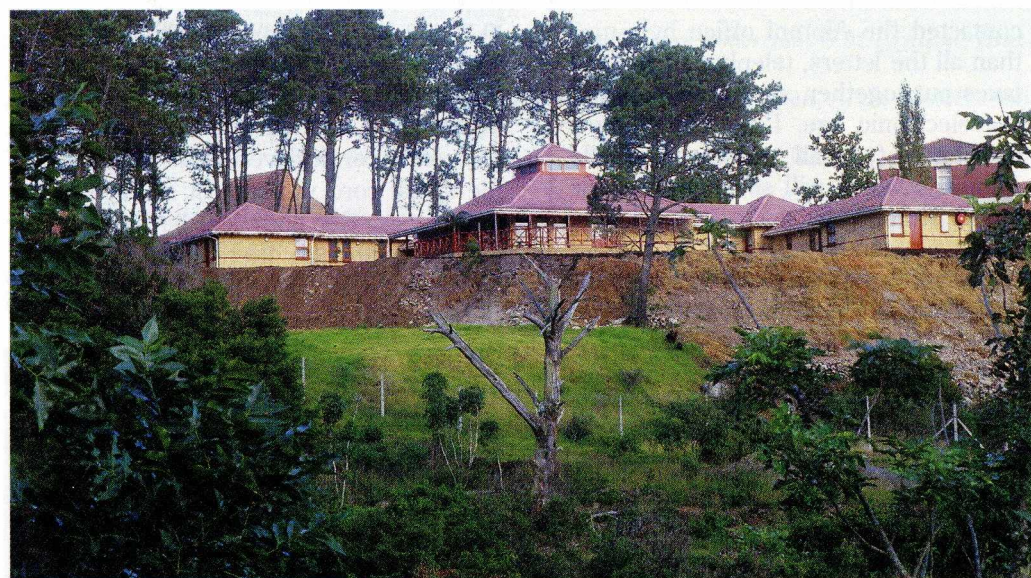
View of the Centre from Hamilton Dam.