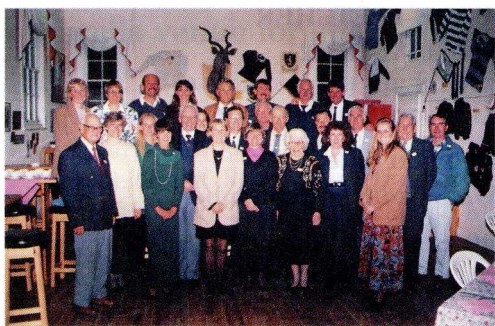
All the ORs at the Queenstown reunion