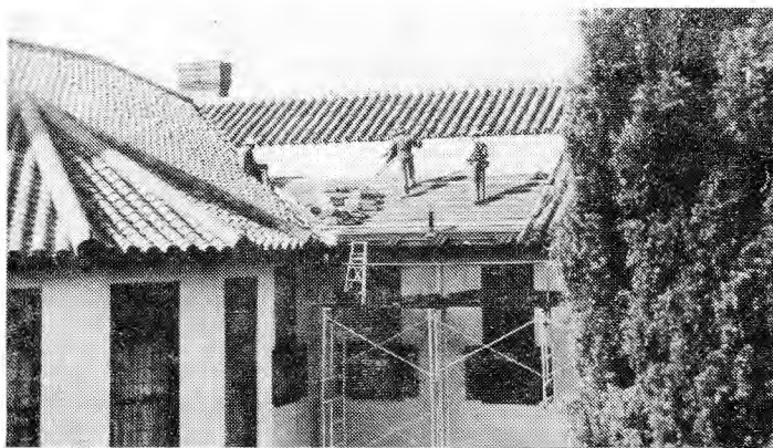
The re-roofing of the south-east wing of Rhodes University's Administration building in progress.